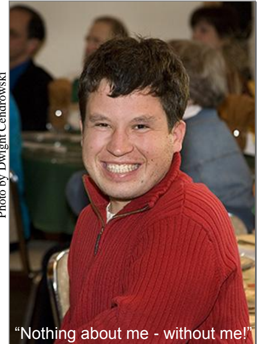
"Nothing about me - without me!"